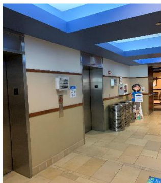
Take the elevators from the 2nd floor to the Tunnel (T)