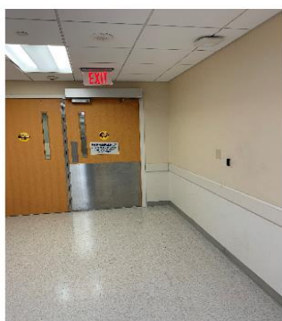
You will need to badge in to the off stage area & elevators