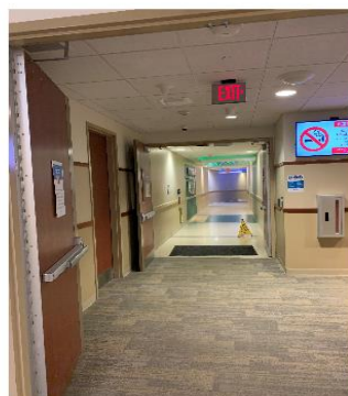
Once in the Tunnel, walk straight ahead All 5 Values are in View