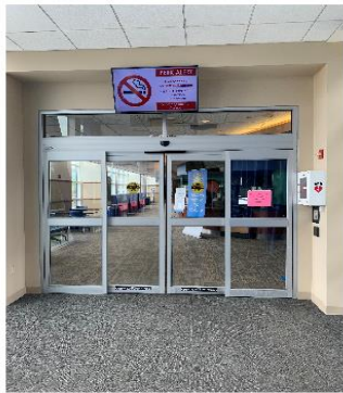
Enter the Corporate Center on the 2nd floor Skywalk