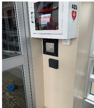
You will need to badge in at the card reader under the AED