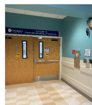
You will come to an intersection labeled Children's- Badge In