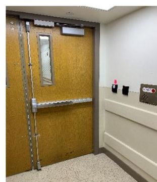
Going back home you will need to badge into Children's Tunnel