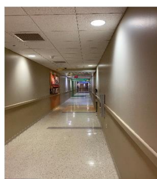
You will reverse the order in which you came in to go home