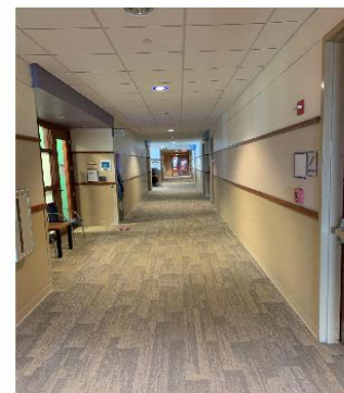
Walk down the hallway until you reach the elevators