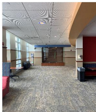
Move pass the Seven Sister's Cafe and take a right