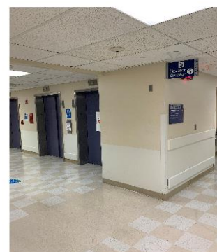
You can use the "S" elevators to get to surgery & clinics