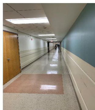
Walk through the doors and enter Froedtert's Hallway