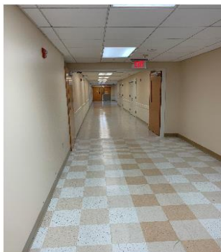
Take a left to enter the hallway to the "X" elevators for W Tower