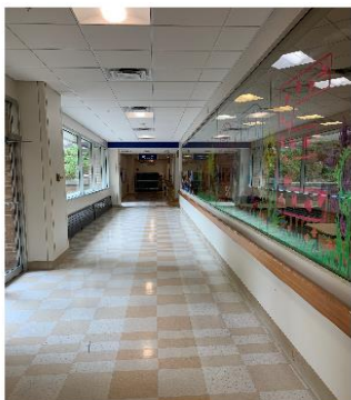
Once you badge in you will pass the cafeteria on the right