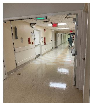
You will follow this hallway until you reach the elevators