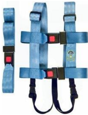
2. Seat belt