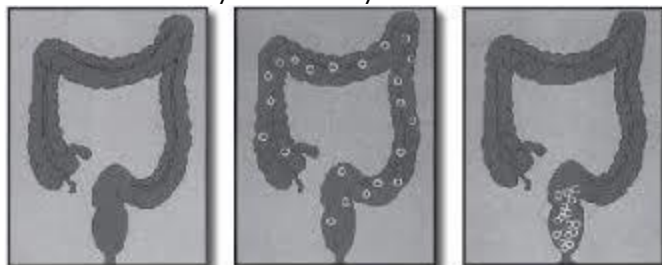
X-ray: no rings in colon

After an x-ray, the doctor will count the number of rings, if any, that are still in your child's intestines. This will help the doctor to decide the type of condition that your child has and how to treat it. If some of the rings are not swallowed, the test may not be correct.