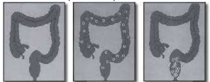
X-ray: no rings in colon

After an x-ray, the doctor will count the number of rings, if any, that are still in your child's intestines. This will help the doctor to decide the type of condition that your child has and how to treat it. If some of the rings are not swallowed, the test may not be correct.