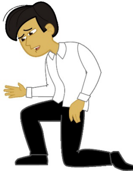
c. Listen with your ears.