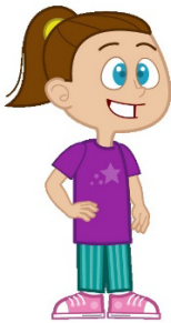
a. Stand still.

2. Circle the four ways to show active listening.