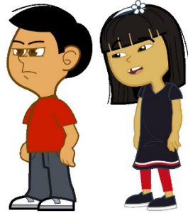
b. Ignoring others