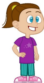
a. Stand still.

2. Circle the four ways to show active listening.