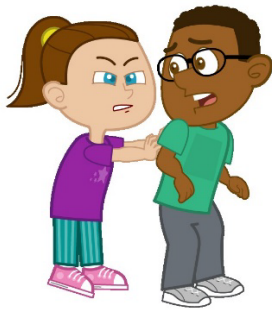
a. Pushing others