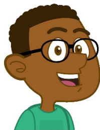
d. Look with your eyes.