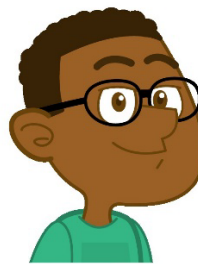
e. Lips are closed.