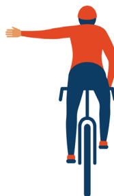
Making a left turn